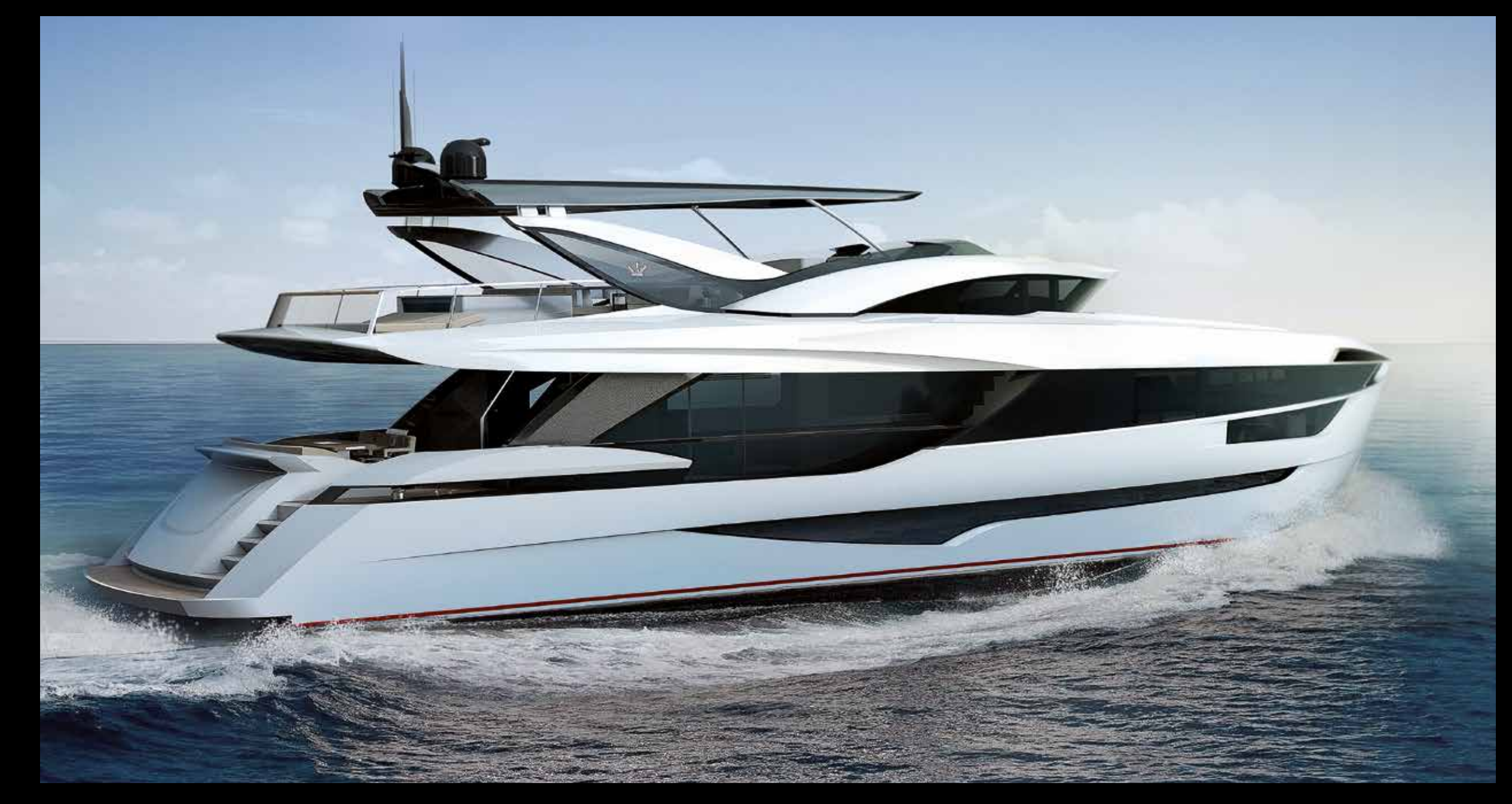
New concept, new design, new solutions: blurring the lines between interior and exterior spaces.