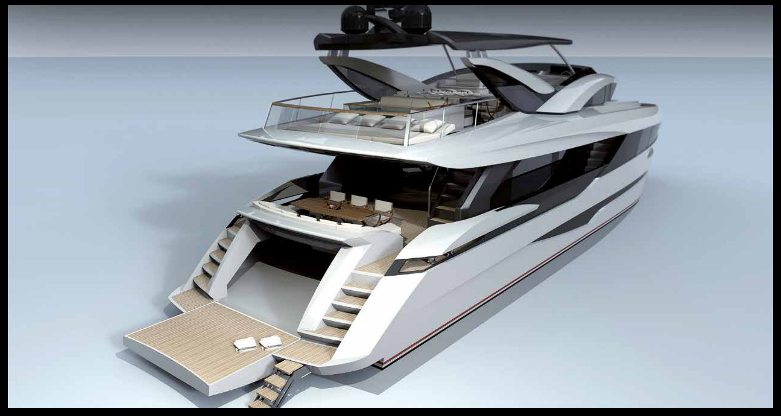
One step from the sea

Desire an exclusive beach area directly on the sea? Ready to launch your adventure with the tender in the stern garage?